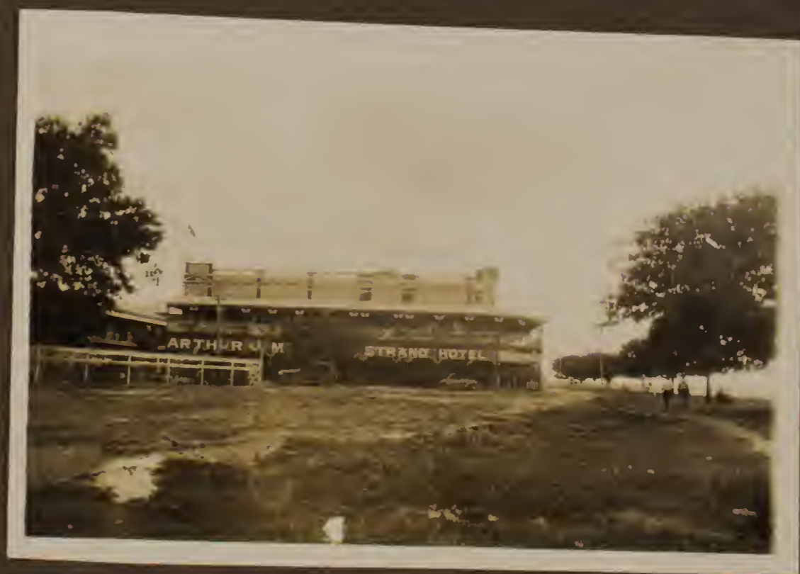
Strand Hotel